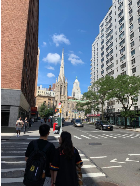
Church Near My Hall